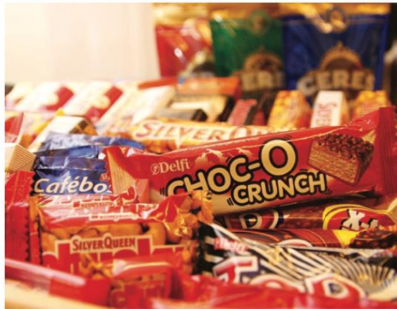
Headquartered in Singapore, Delfi's products are sold in over 10 countries in Asia

We believe consumers' cravings for indulgence will continue to grow in the chocolate confectionery industry. However, there will be a growing trend towards healthier products. Chocolate players will need to better communicate to consumers the ingredients used in products (such as where and how they are sourced) and packaging materials. We expect this to drive demand for products such as those which are plant-based, have a higher cocoa content, less sugar and milk, and less plastic being used in packaging.